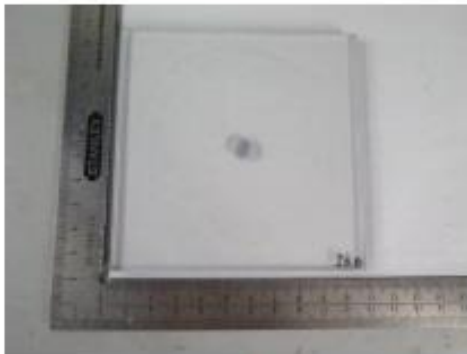
After 500 cycles