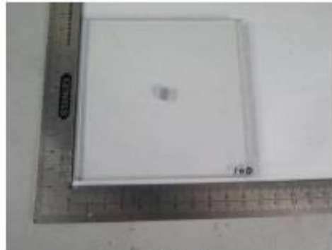
After 100 cycles